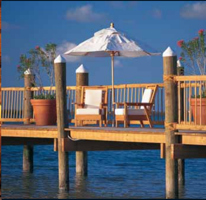
Left: Every villa features a private verandah overlooking the ocean. Above: Throughout the island there are secluded spots just for two.