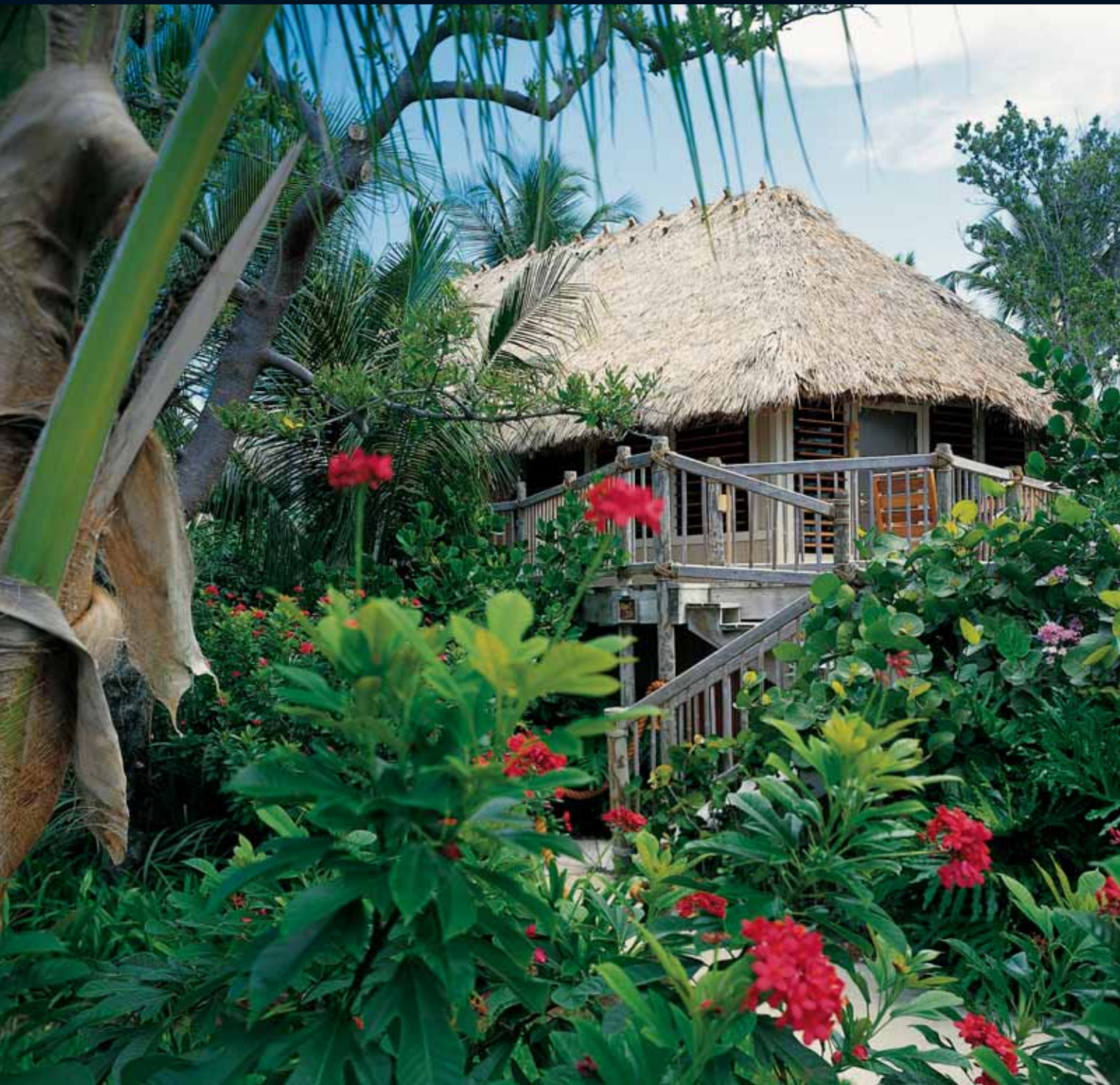
Live like Robinson Crusoe in a luxury thatched-roof villa set amongst the flowering plants on Little Palm Island.